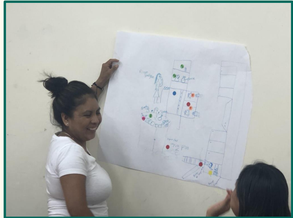
Domestic Cleaners Monthly meeting at Make the Road New York (Queens) July 26, 2019