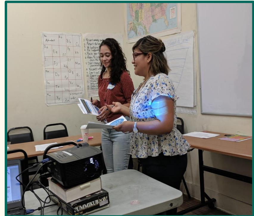
Domestic Cleaners Monthly meeting at Make the Road New York (Queens) July 26, 2019